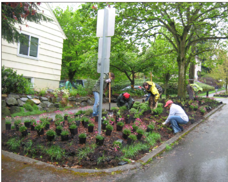
Volunteers planting a new garden (The Pollinator Pathway)

The process for establishing the gardens involves property owners and the willing efforts of many volunteers. Once a new site on the corridor is established for a garden the process begins. The calendar for the new garden going in this year