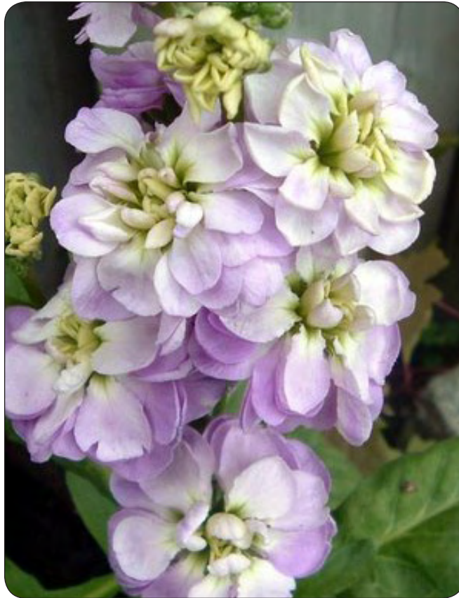
Matthiola incana cv.

Maybe it is this stubby little name, "stock" shortened from "stock gillyflower" which has turned people off to this Mediterranean perennial. There are many gillyflowers: clove gillyflowers or carnations ( Dianthus caryophyllus ), Queen's gillyflower ( Hesperis matronalis ), and wall gillyflower ( Erysimum cheiri ). All are grown for their lovely clove-like fragrance. Actually, the name