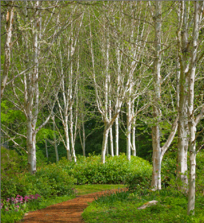
Birches line a pathway at The Bloedel Reserve (David Perry)

wanders through two acres of serene Moss Garden, one of the largest in the United States, with mosses carpeting the forest floor, enhanced by a stream, ferns, huckleberries, stumps, and stones. A bark trail leads through a corner opening of a high yew hedge, enclosing the surprise of the Reflection Pool, one of the most romantic 19th century features of the garden. You are compelled to pause and gaze at this linear beauty within the forest. Beyond the pond is the French Country style Bloedel residence overlooking Puget Sound waters. This is one of few gardens open to the public located on the waterfront offering a view of the Cascade Mountains. Nestled deep in the Re-