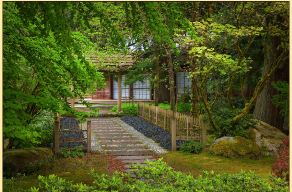
The Bloedel Reserve captures a peaceful mood (David Perry)

As Prentice Bloedel wished, the Reserve presents a series of experiences